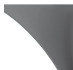
AN Anthracite grey